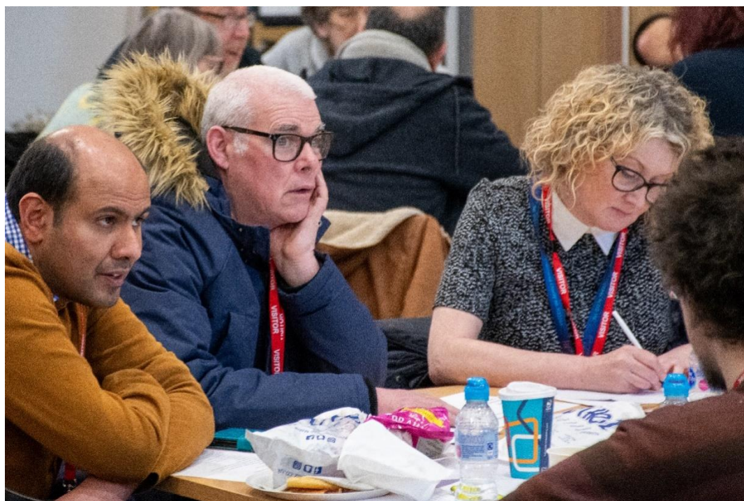
Bradford People First