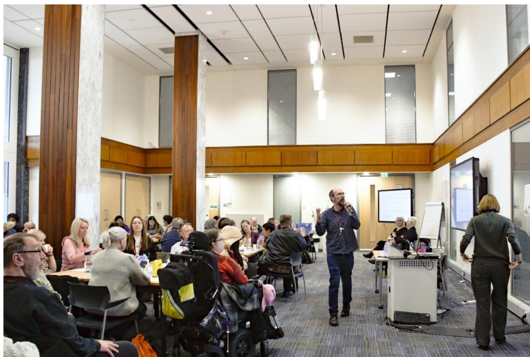
Overview of the event

We will support the disabled person who is elected to be the representative on Bradford Council's Health and Social Care Overview and Scrutiny Committee.