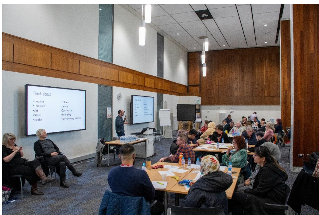
Overview of the event

The event brought together 90 people. These included disabled people and carers, people who work in services used by disabled people, as well as colleagues from Bradford Council and the NHS.