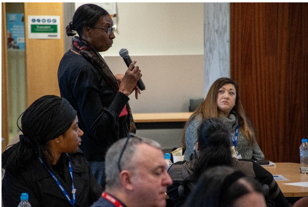
Feeding back from the discussion

Over the coming months we will be setting up some working groups, these groups will look at how the CPP achieves its goals.