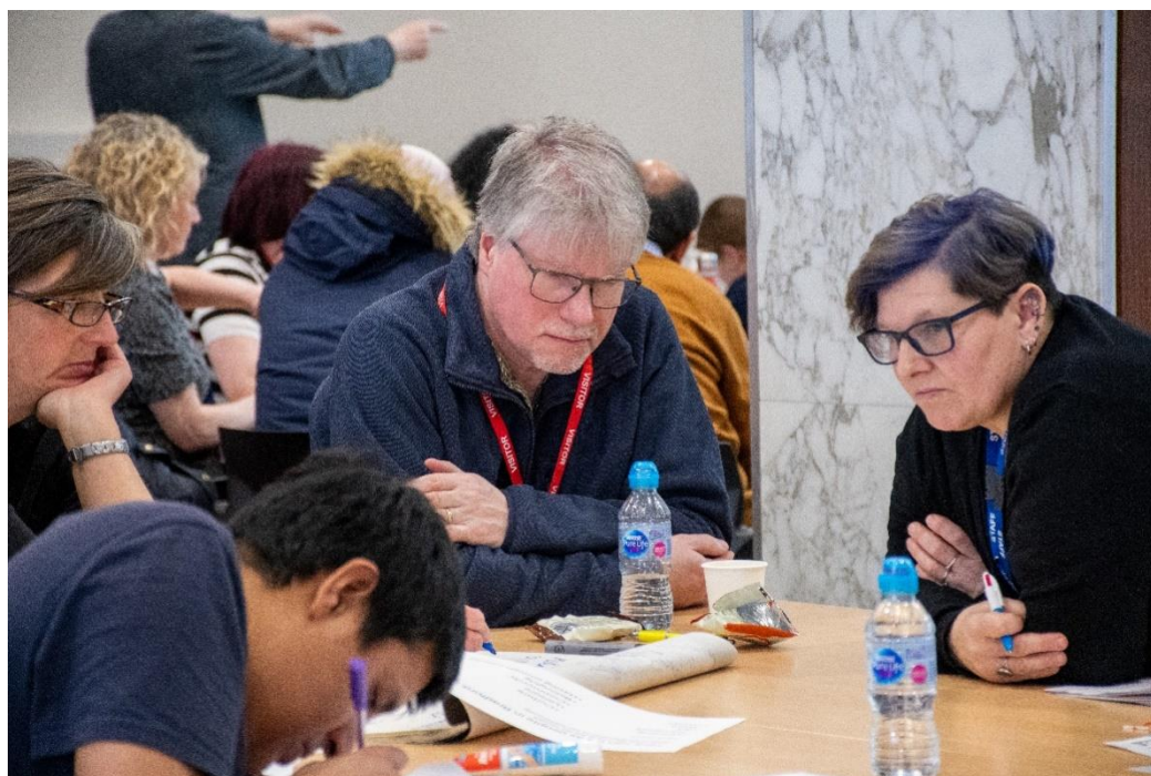
Discussing ideas around the table